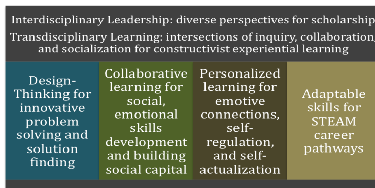
Figure 1. Intersections of STEAM

Intersections of art into STEM education encourages the development of empathy, collaboration, and communication skills, which are crucial for thriving in STEM-related fields (Amalu et al., 2023). In addition, the intersection of a dCoP in preservice and experienced teacher, higher education learning environments facilitates conversations between educators from multiple disciplines, resulting in increased empathy for student learners. The intersection of STEAM and dCoPs affords authentic constructivist, communicative, social, emotional learning environments for both educators and students. STEAM facilitates social emotional learning by affording students pathways for cultivating resilience, teamwork, problem-solving, and communication skills through practical, interdisciplinary tasks (Rikoon et al., 2018). Providing students with cognitive, social, emotional development creates a holistic learning environment for supporting the academic and social, emotional learning needs of all learners.