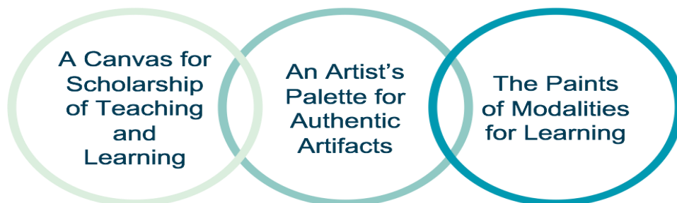
Figure 4. Components of the cybernetic three realm theoretical model

Applying a cybernetic mindset in the development of a cybernetic dCoP for the examination of digital artifacts with education students in higher education results in three significant realms of a cybernetic learning environment. Each realm serves as a domain or sphere of knowledge within cybernetic educational settings. The Cybernetic Three-Realm Theoretical Model juxtaposes the utilization and input of digital artifacts within a cybernetic framework with the resulting outputs for supporting STEAM education and educational leadership nurturing. When considering each realm, it is important to first consider the role of cybernetics. In the Cybernetic Three-Realm Theoretical Model , cybernetics is analogous to the brushstrokes of paint from the artist's palette to canvas. Cybernetic brushstrokes are the medium for moving paint from palette to canvas, and as such, a cybernetic brushstroke analogy is present within each realm for creating an aesthetic, scientific perspective with respect to the intersections of cybernetics and education (Figure 4).