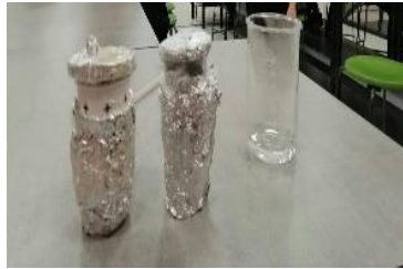
Figure 2. Sample products from the STEM activities

In the research process, students needed scientific knowledge to accomplish each design. In order to reach this scientific knowledge, they conducted experiments, collected data and made conclusions by operating an inquiry process. They also had to use basic mathematical skills such as calculating, measuring, matching, and calculating. Additionally, they offered solutions with the scientific results they obtained. They evaluated the proposed solutions as a group and evaluated them in the context of the criteria and limitations of their designs. In the last stage, students presented their designs and the process of creating this design to their classmates. Some of the STEM group activities of the 10-week implementation period of the research are given in Table 1.