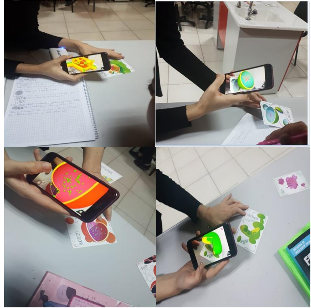
Figure 1. Examples of applications made by the experiment group students

This research was carried out with 7th grade students in a secondary school in Antalya. After determining the subject to be used in the experimental process of the research (Structure of Plant and Animal Cell, Cell Organelles), the AR application to be used on the subject was determined and the material (Science Cards) to be used during Augmented Reality application was provided on the internet. Experimental group students were informed about the application before the application. The application was conducted on both the experimental and the control groups by the same teacher. Three prospective science teachers participated in the applications as observers. While the subjects in the experimental group were taught using AR-based material, the same subjects in the control group were taught in two dimensions based on textbooks. During the four-week unit, AR applications are used in appropriate times for the experimental group. Photographs taken during the augmented reality application to the experimental group are shown in Figure 1.