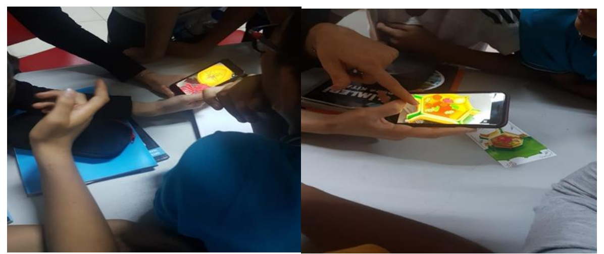
Figure 3. Examples showing students' interest in AR implementation

Student A:...I wish we used augmented reality applications in our new subjects, the lesson was very enjoyable.