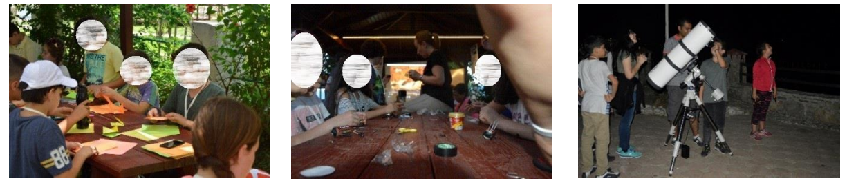
Figure 2. First day activities of the science and nature camp

I^{st} Day: On the first day of camp, the students engaged the areas of math, science education, and astronomy. They performed mathematical designs with origami and experienced artifact-oriented works with their peers. With "Designs in the Light of the History: From Invisible Steam to Magnetic Field" activity; students get to know about the Industrial Revolution. They took a step to engineering and experienced construction of an electric motor from the magnetic field in the basis of the history of science process. Therefore, they discovered the process of turning scientific knowledge into artifact using the engineering design process. In the evening, for the purpose of experiencing the out-of-school learning environments that form the basis of STEM education, they met the sky in the atmosphere of Akyaka campsite and performed the first sky observation of the camp (see Figure 2).