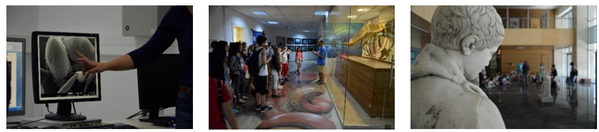
Figure 6. Fifth day activities of the science and nature camp

5<sup>th</sup> Day:Students came together with experts from Art, History, Biology, Materials Engineering, Physics, Atomic Research, and Water Creatures and Information Technologies in their career choices for STEM fields. They had the opportunity of closely observing the laboratories and scientific equipment (scanning tunnel microscope) used by a scientist working in nano sizes in basic sciences and meeting with the scientist and his team. They found the answers to questions they were curious about. On the other hand, they visited the laboratories and collections with the scientists working the underwater creatures. Apart from that, accompanied with experts, they visited Turkey's first indoor moulage museum, Mugla Sttki Kocman University Moulage Museum in order to recognize the cultural heritage that the university tries to bring the local people in their university. On the evening of the fifth day, an activity on a holistic point of view towards science and thinking outside of the box is carried out with the students (see Figure 6).