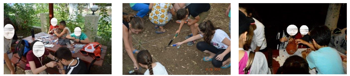
Figure 3. Second day activities of the science and nature camp

2^{nd} Day: To support participants' career choices for the STEM areas, students engaged astronomy and archeology. With the "My Eyes are Always on Sky" activity, students learned developing strategies to create an artifact and discovering. Using advanced technological tools (telescope), they discovered the scientific knowledge underlying these tools. In addition, they created their own artifacts working with their peers. "The Nature of Science: Archeology" activity followed by "the Typical Day for a Scientist: From Mythology to Archeology" activity, they had a holistic point of view towards science by comprehending the relationship between STEM and social sciences. In the evening, with the activity "Astronomy I", they experienced the using of advanced technological tools and made sky observations with their own handmade telescopes (see Figure 3).