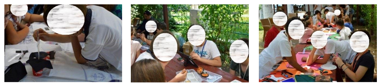
Figure 7. Sixth day activities of the science and nature camp

6^{th} Day: This day, in the careers for STEM fields, students involved in Nano-Technology studies, Information and Coding, and Mathematics. They started the day with a design activity that they implemented on Nano-Fabrics in the field of Nano-Technology so that they internalized the engineering design process. They carried out the activity regarding coding and developing a robot (makey kit) in order to work artifact-oriented way with peers, to develop strategies to create artifacts and to learn discover. They experienced writing commands and some basic mathematical codes. In addition to this, they created the required spare parts in their designs with a 3D printer. In the evening, they prepared for the science fest with the project team (see Figure 7).