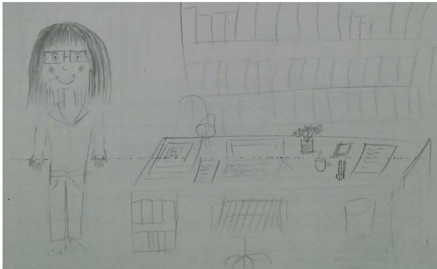
Figure 1. Sample image belongs to a gifted education teacher candidate

* Even though the code of female image was not on the markers as a stereotype, it was included in the table because it was an important finding for study.